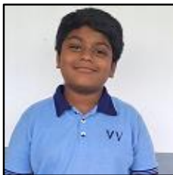
CAPTAIN SAMEDWINSTALIN A - V