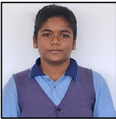
CAPTAIN MAGIMA - IX